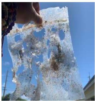
Figure 1. Unusual items found during the cleanup included a broom and plastic bag with marine life bites.