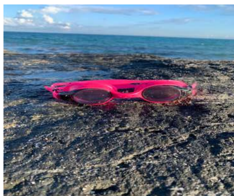
Figure 1. An unusual item found this month was a pair of goggles