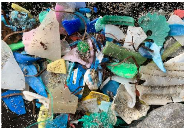
Figure 1. Hard plastic pieces found during the January beach cleanups