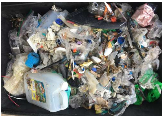
Figure 1. Debris collected during a cleanup in January.