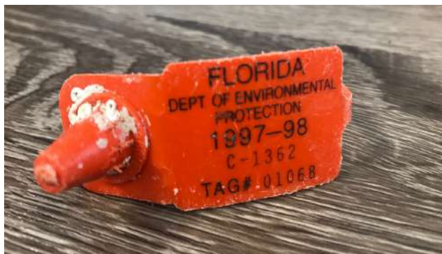
Figure 1. Unusual items found during the cleanup included a DEP fish tag, surfboard fin and Air Pods.