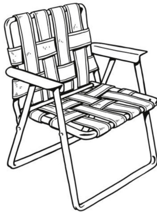
Figure 1. An unusual item found during the month of December included a lawn chair