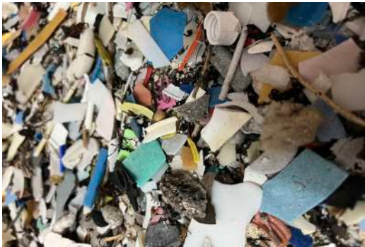
Figure 1. Hard plastic pieces was the most commonly found marine debris item this month.