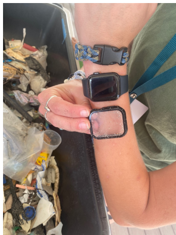
Figure 1. An Apple watch cover was found during the month of September