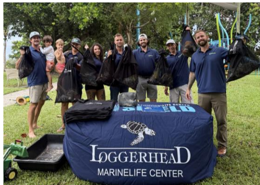
Figure 1. Seaside Marine Construction volunteers with collected marine debris on 10.10.2025.