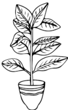
Figure 1. Strange items found in October, 2023, include 26 fake plants.