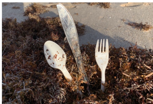
Figure 1. Set of utensils found along the beach in the month of May 2023.