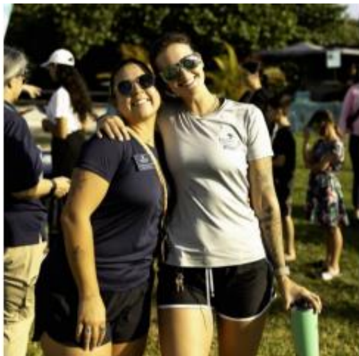
Figure 3. Conservation team during a beach clean-up.