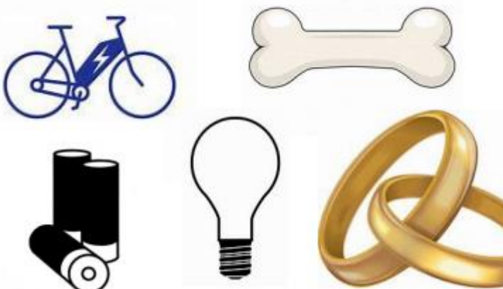
Figure 1. Unusual items found during clean-ups in March