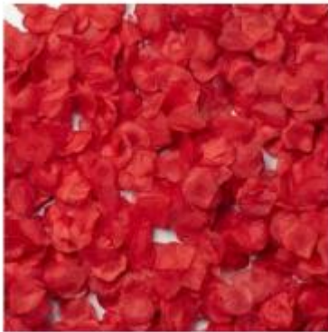
Figure 1. Volunteers found 400+ synthetic rose petals on the beach during July 2024.