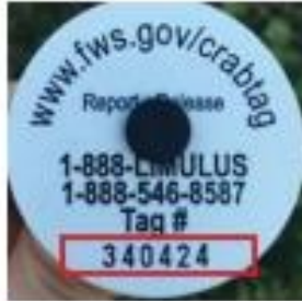
Figure 1. Unusual items found during Jan. beach cleanups; Buoy ball, FWC tag, metal pipe.