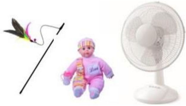
Figure 1. Unusual items found during our Feb. beach cleanups; Cat toy, fan, baby doll.