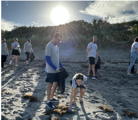
Figure 1. Beach cleanup volunteers from 12.01.25.