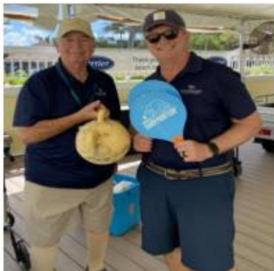
Figure 1. Blue Friends volunteers helping with Saturday beach clean-up.