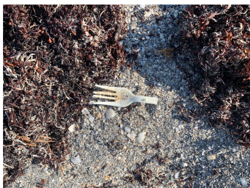
Figure 1. Plastic fork found in the sand during an April beach clean-up