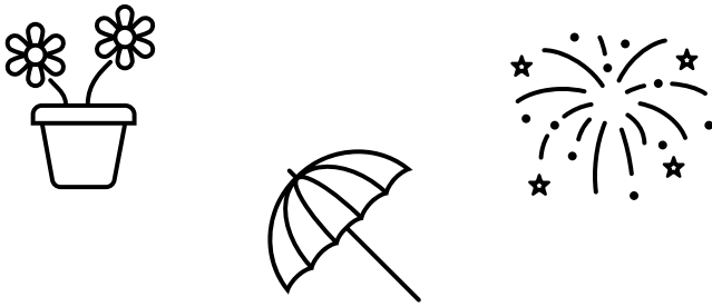
Figure 1. Some unusual items found during 2024 included an umbrella, firework casings, and 23 flowerpots!